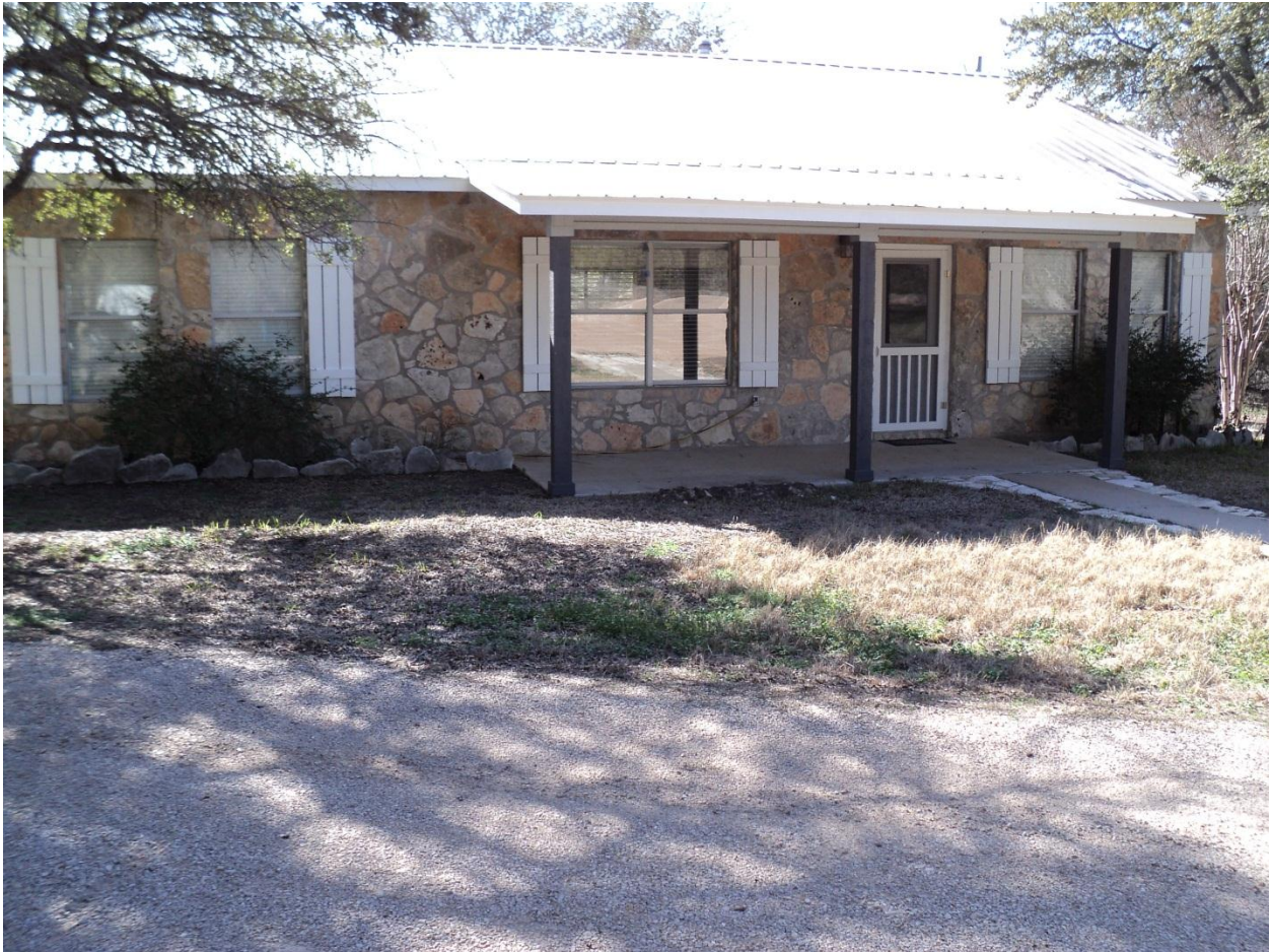
Picture of the Front of the Residence